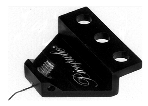
Model 110H Picoprobe®