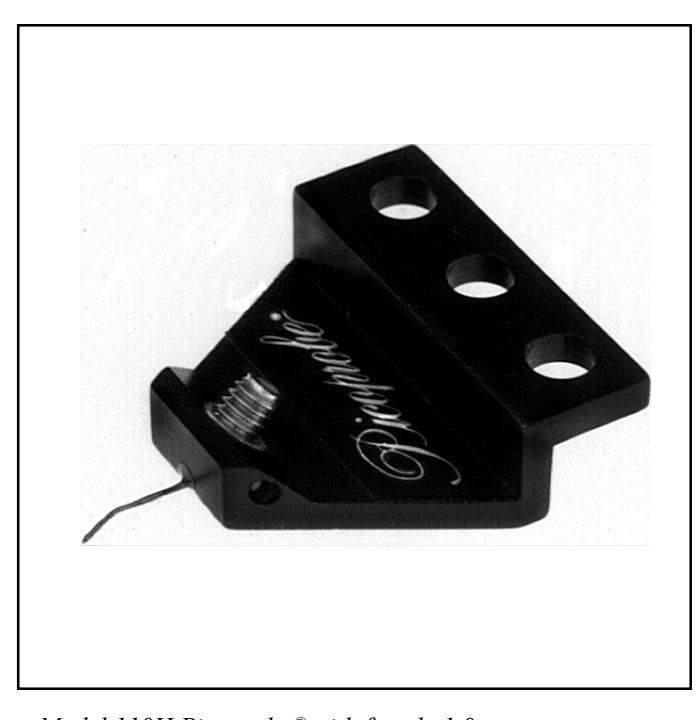
Model 110H Picoprobe® with female 1.0 mm connector